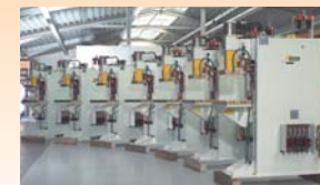
NIMAK series welding machines.

The welding machinery and welding equipment manufacturer NIMAK GmbH can build hundreds of variants of one single type of machine, including special purpose machinery and equipment. CATIA V5 and ENOVIA SmarTeam help to manage the data volumes.