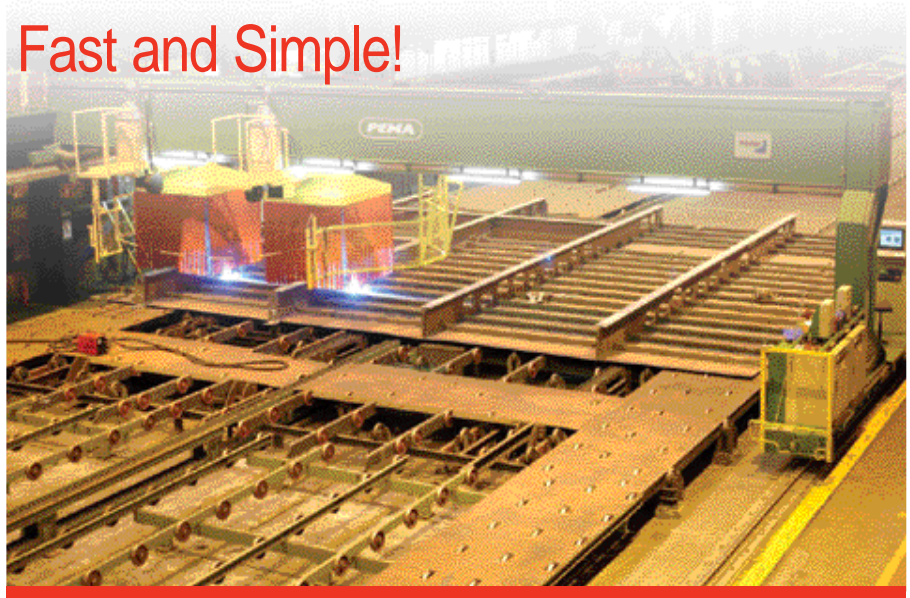
Pema gantry welds a ship structure

It takes software development skills and a deep understanding of the robotized ship block welding procedure to develop software for a unique process in this industry segment. Delfoi's and Pemamek's union is a perfect match of software and process know-how. Pemamek, with products found in 40 countries and all continents, has delivered several robots to shipyards globally. Twenty-five years of experience in arc welding and state-of-the-